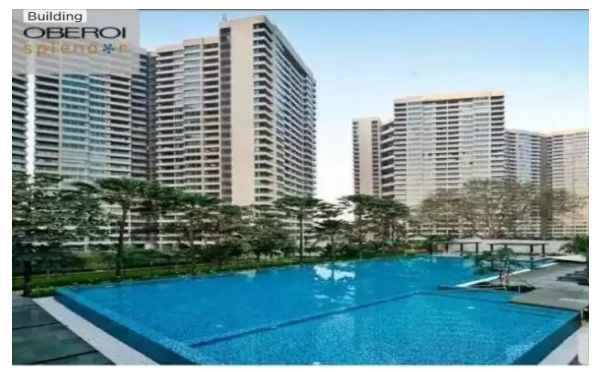
Project Name: Oberoi Splendor, JVLR Leased multiple flats of 2BHK & 3BHK