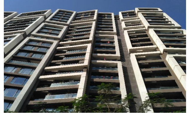
Building Name: Rustomjee Oriana, BKC, Bandra Leased premium 3BHK-1600 Sq.Ft