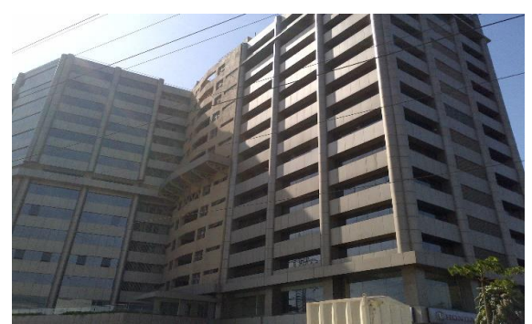
Building Name: Godrej Coliseum, Sion Sale transaction of 38,000 Sq.Ft (Office Sizes ranging from 5000 Sq.Ft to 16,000 Sq.Ft)