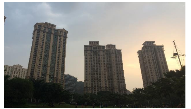
Building: Octavius, Hiranandani Gardens Powai Leased Premium 3BHK-1500 Sq.Ft Flat