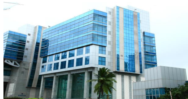
Building Name: Windsor House, CST Road, Off. BKC Leased 4162 Sq.Ft Fully Furnished Office